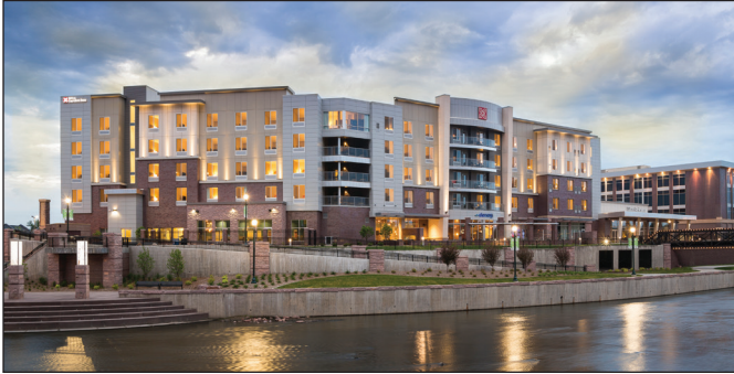
The Hilton Garden Inn Downtown Sioux Falls, SD is the site of the 2016 IOMSA Summer Convention.

JUNE 12 - 14, 2016 • HILTON GARDEN INN DOWNTOWN • SIOUX FALLS, SD