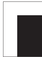
1/2 Pg. Island