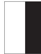
1/2 Pg. Vertical