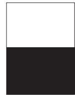
1/2 Pg. Horz.